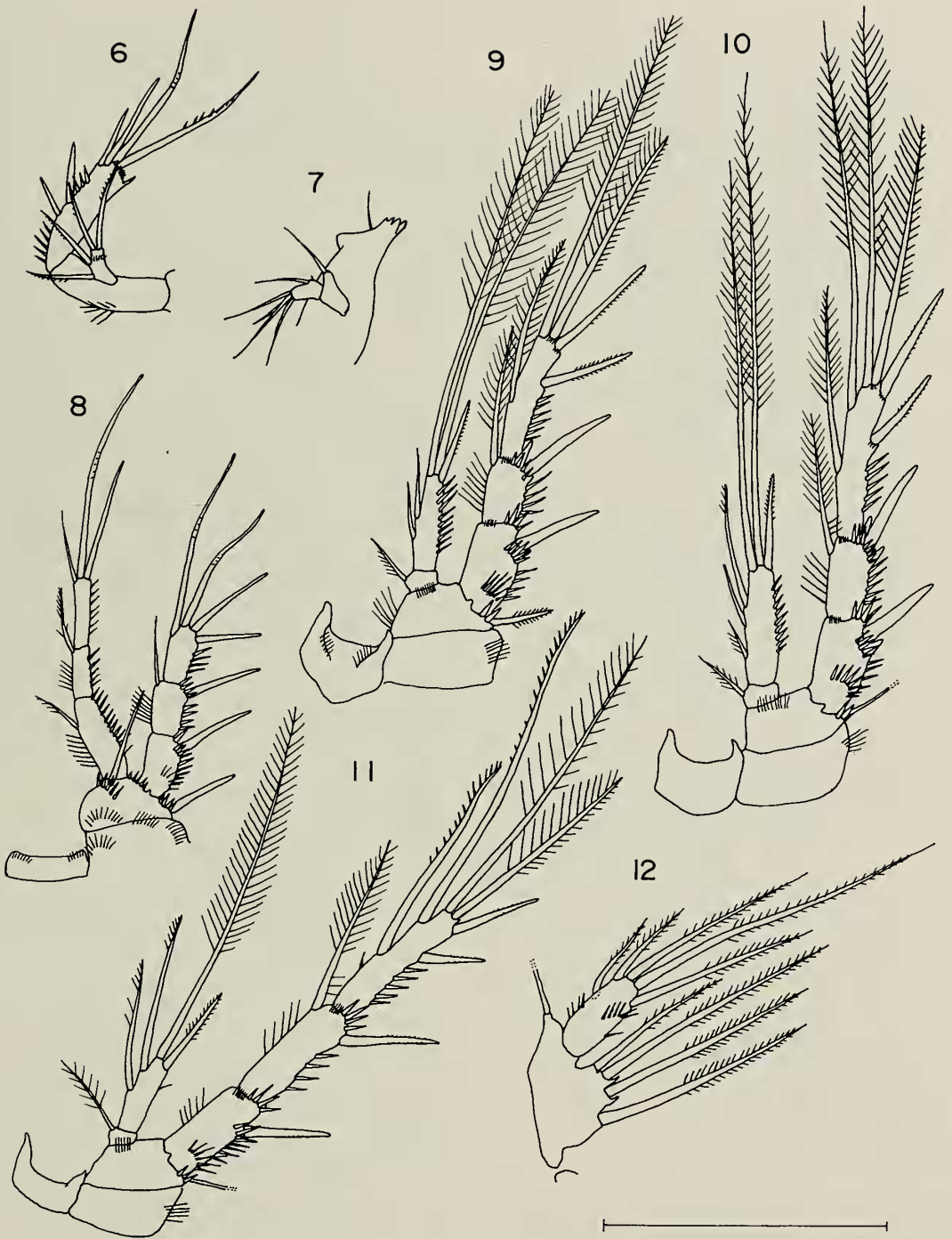
Figs. 6–12. Elaphoidella nepalensis , n. sp., female, holotype: 6, Antenna; 7, Mandible; 8, Leg 1 and coupler; 9, Leg 2 and coupler; 10, Leg 3 and coupler; 11, Leg 4 and coupler; 12, Leg 5. Scale = 100 \mu m.